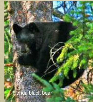
Florida black bear